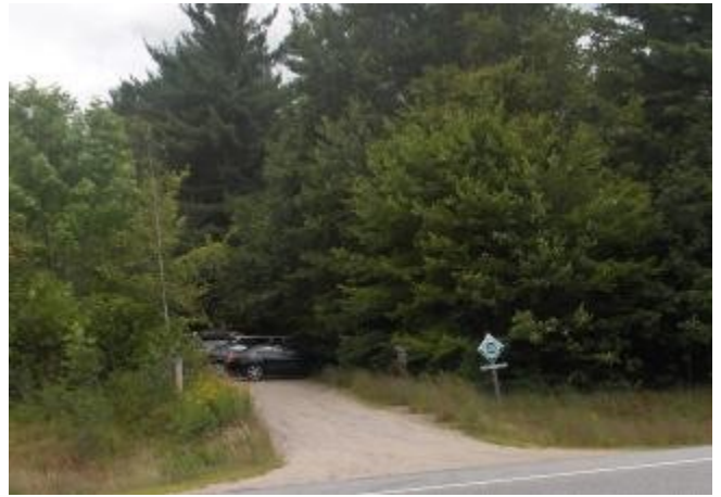
Mt. Will Trail parking is located opposite the Recycling and Transfer Station on Route 2 approximately 5.5 miles from Bethel Village.

For further information, or to report problems, please call the Bethel Town Office at 824-2669.