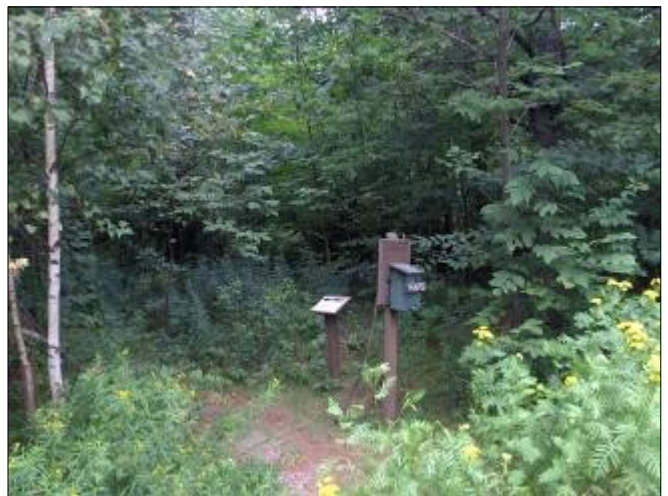
Once in the Mt Will Trail parking area you can easily see the trail starting point and map box.

Respect signs posted by private landowners