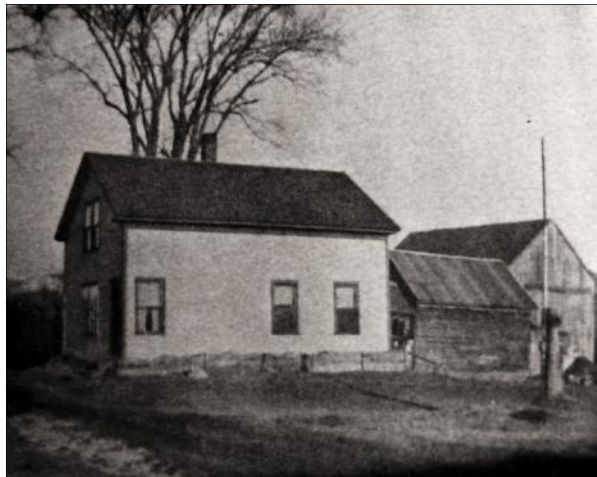
This is the home of the John Nowlin family as it looked in 1946 when Mrs. Julia Fleet took the photo. Although the shed and barn are gone the house with some remodeling was moved back from the road but it still stands in 2011, located on the Sunday River Road across from the lower entrance to Coombs Village.