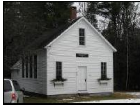
THE LOWER SUNDAY RIVER SCHOOLHOUSE INSIDE AND OUTSIDE; IN THE CENTER REAR OF THE LEFT PHOTO STANDS THE ORGAN USED FOR CHURCH AND SUNDAY SCHOOL