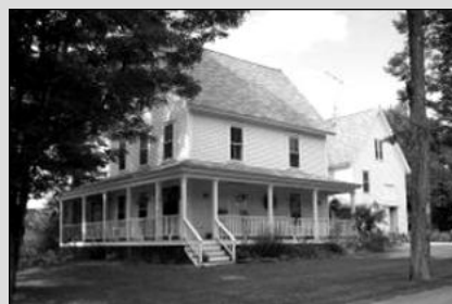
Alpine House