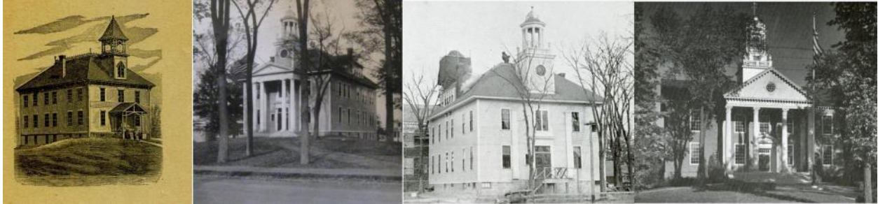
Left to Right: 1893, 1930, 1932 (last view of 1881 school) and Hanscom Hall (1933)

From 1836 to 2011 there have been at least four academy libraries: the first academy building (1836-1880), the second academy hall (1881-1932) and the current one, Hanscom Hall, which saw its original cozy library space grow and take over a large study hall area. Giving up a large day student enrollment wiped out the need for a study hall.