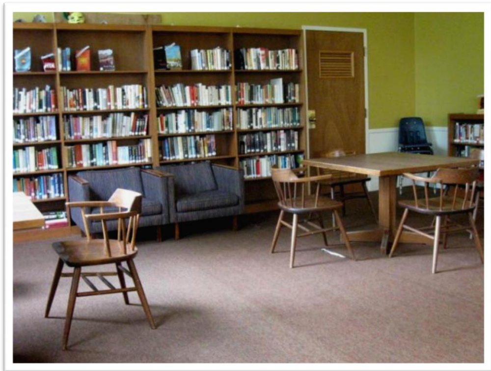
Reading and work area – a raised split level behind circulation desk