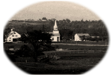
2nd Congregational Church in Mayville—the church society dissolved in 1890.