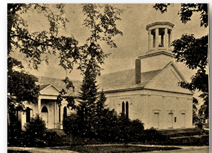
Congregational Church 1930