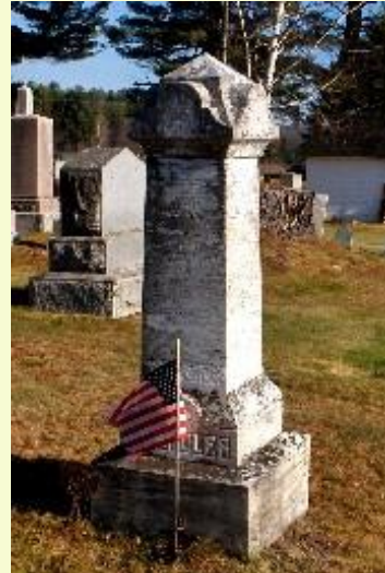
The Chandler family monument at Riverside Cemetery.