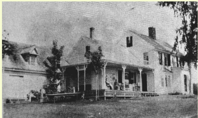
Waterspout Mountain House was typical of summer vacation places for boarders coming to the country to escape city heat.

During the Civil War Chandler served three years, in the 4th Maine Battery, Light Artillery. Went in as a private; came home as quartermaster ser-